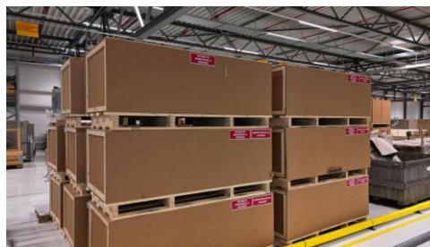
Odd-sized items are stored on a mezzanine