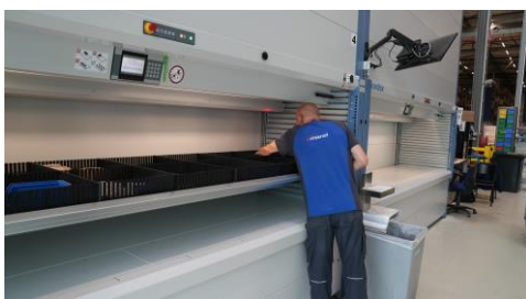
Smaller goods are stored in five vertical lift modules. These enable compact storage and efficient order picking.

Whereas a conventional approach was considered the optimal choice for the larger items, mechanization has been beneficial for the smaller goods. They are stored in five vertical lift modules. Marel and Groenewout worked in close collaboration to decide on the size of the various areas, the necessary functionalities and the positioning of the new warehouse.