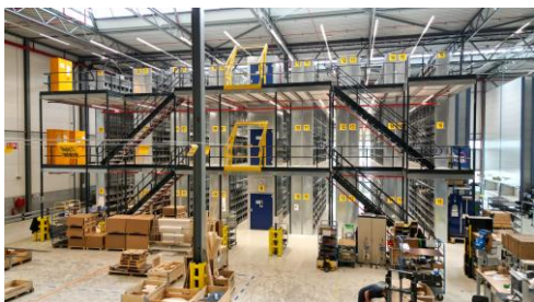
The resulting warehouse concept is traditional: racking over three floors, including lifts, and pallet racks for the larger items.