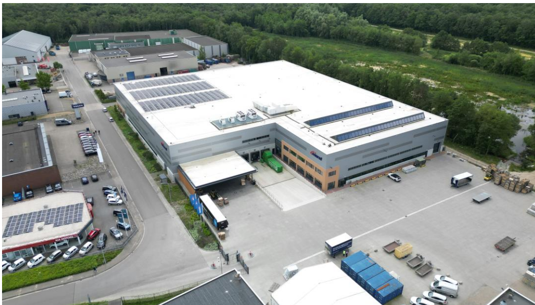
The new facility, right next door to the factory, is a perfect fit with the manufacturer's growth strategy.

In 2021, Marel got the opportunity to buy a piece of land next to its existing site in Boxmeer. Smal: "That opened the door to the realization of a new, futureproof warehouse, where we could manage all our storage operations under the same roof and further professionalize our logistics activities. Moreover, it was a perfect fit with our growth strategy."