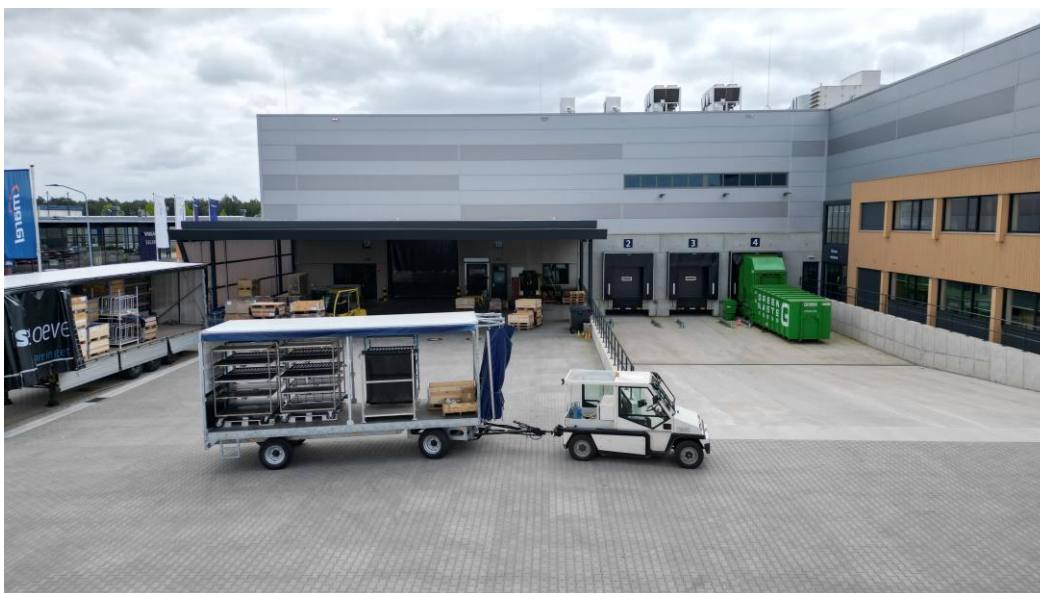
A shuttle service transports orders to a handling location near the assembly department.

The new warehouse offers lots of space, is clearly laid out, and has plenty of natural light. "Together with the new equipment and the underfloor heating, this results in significantly improved working conditions and more job satisfaction," adds the warehouse manager.