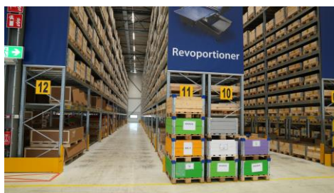
The transition to Euro-pallets has created higher storage capacity.